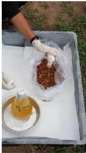
1. Adding Arabic gum

Cultivating faba bean as green manure in the Mediterranean region