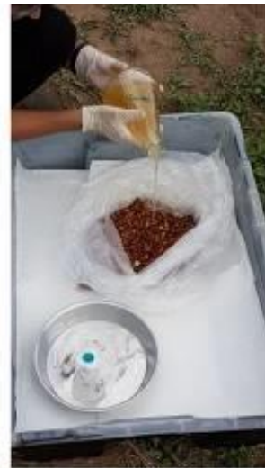
3. Adding rhizobia solution