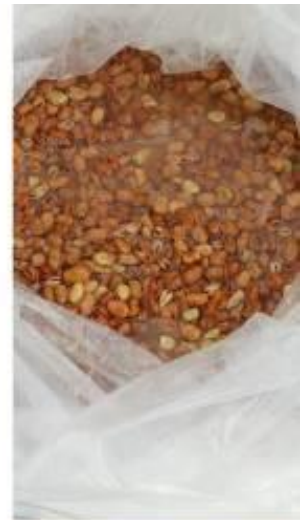
4. Add rhizobia solution and sow.

Procedure of inoculation.