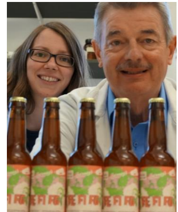
Legume beer brewing experiments in the lab.