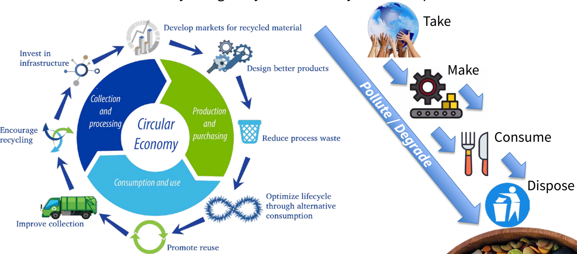
Image: Sustainable Global Resources Ltd. Recycling Council of Ontario